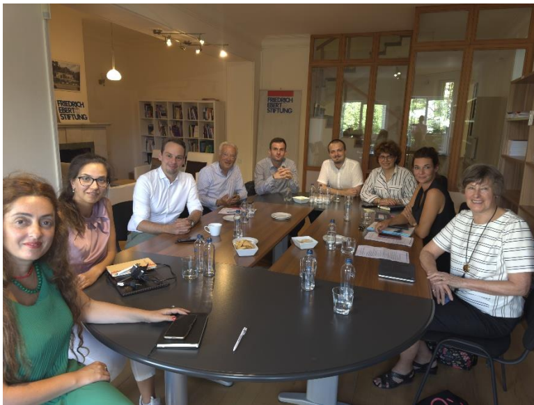
With members of the 'For People' Party at the Friedrich Ebert Foundation Tbilisi office