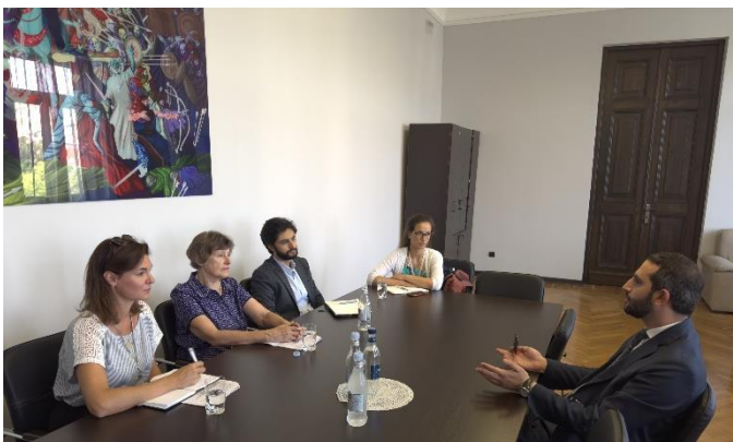
With Ruben Rubinyan, Vice President of the National Assembly