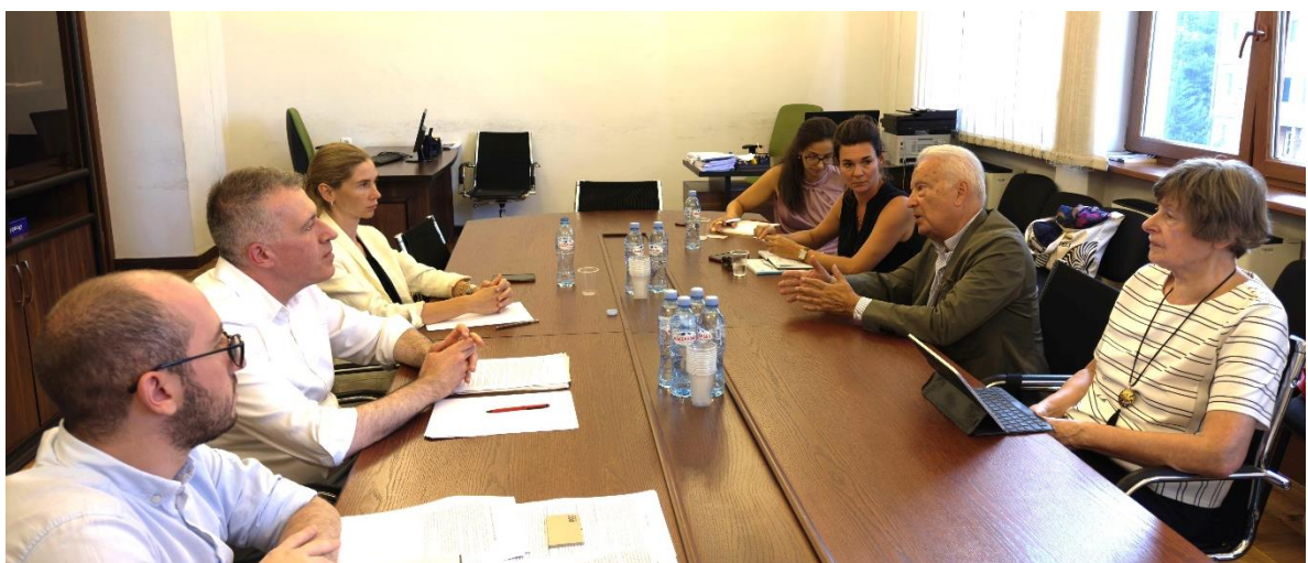
With Member of Parliament Tinatin Bokuchava ('United National Movement' party)