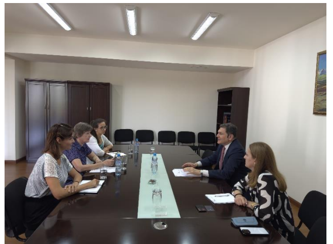
With Paruyr Hovhanissyan, Deputy Foreign Minister